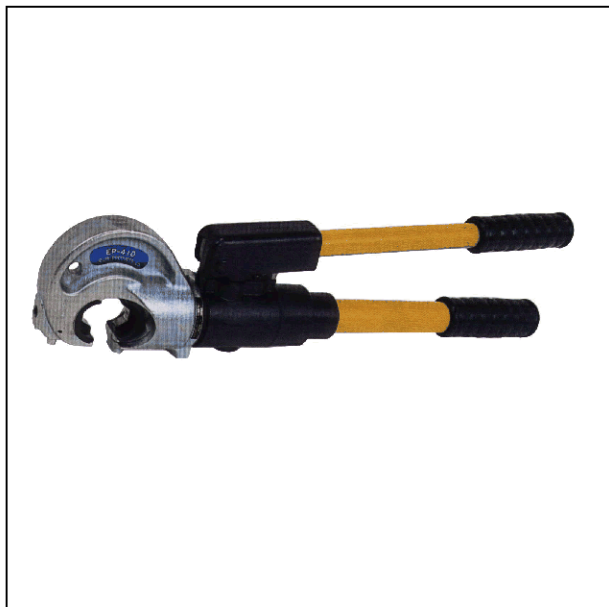
EP-410 Insulated head standard